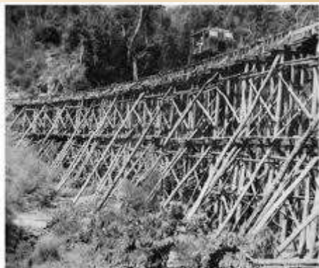
THE HINTOKU-TAMPI RAILWAY BRIDGE. Rough wabi timber has been used in the construction of this bridge, whose height was 100 feet. Note the small diesel-driven trolly. The photograph was taken in October 1943.